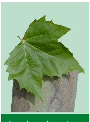
hite oak London plane tree

Need help identifying trees? Try reaching out to your local extension agent! Many great resources can also be found at <a href="https://forestry.ca.uky.edu/tree_id">https://forestry.ca.uky.edu/tree_id</a>.