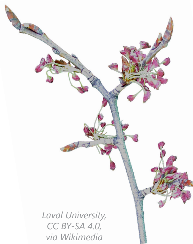
Laval University, CC BY-SA 4.0, via Wikimedia Commons

Samaras (seeds) mature and drop in spring